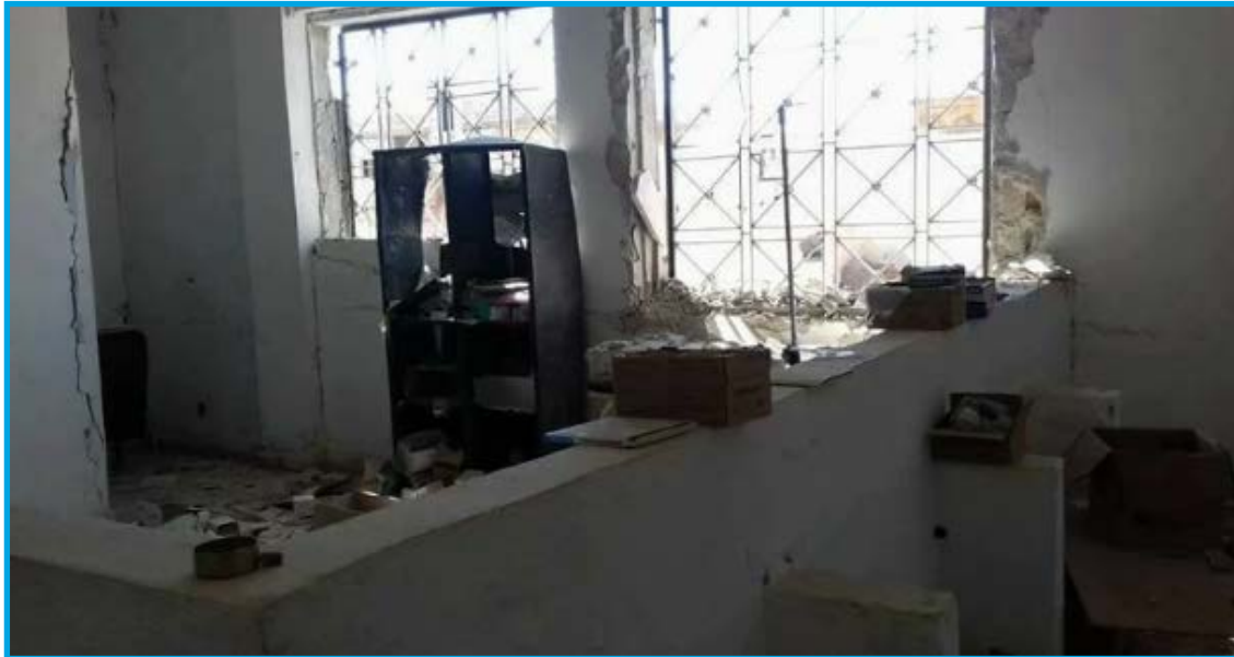
Damages caused by rockets launcher by Syrian regime rocket launchers that shelled the medical point in Kafr Nbouda town in Hama, March 28, 2017

Tuesday, March 28, 2017, fixed-wing Syrian regime forces warplanes fired a number of missiles near the dispensary building -adjacent to the automatic bakery- in Helfaya city in the northwestern suburbs of Hama governorate. The building and its cladding materials were moderately damaged. The city is under the control of armed opposition factions.