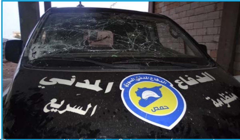
Damages caused by fixed-wing Syrian regime forces warplanes bombing an ambulance belonging to the civil defense center in al Rastan city in Homs, March 24, 2017

Friday, March 24, 2017, fixed-wing Syrian regime forces warplanes fired two missiles near an ambulance belonging to the civil defense center in al Rastan city in the northern suburbs of Homs governorate. The ambulance motor was moderately damaged, and its front glass windows were shattered. The city is under the control of armed opposition factions.