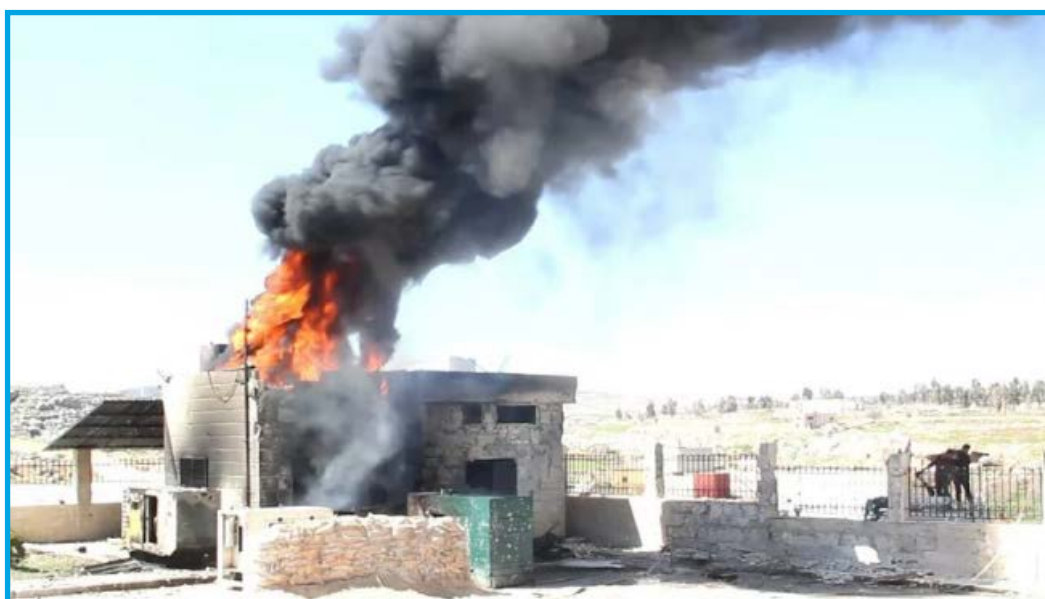
The gas tank room and the generator burning after a bombing by fixed-wing warplanes we believe were Russian in Kafr Nabbol city in Idlib, March 25, 2017

Saturday noon, March 25, 2017, fixed-wing warplanes we believe were Russian carried out three consecutive missile airstrikes near Kafr Nabbol surgical hospital (Formerly al Orient hospital) which is located in northern Kafr Nabbol city in the southern suburbs of Idlib governorate. The hospital’s fuel tank and two generators were moderately damaged. As a result of the heavy bombing, the hospital announced that it is no longer in commission. The city is under the joint control of armed opposition factions and Fateh al Sham Front.