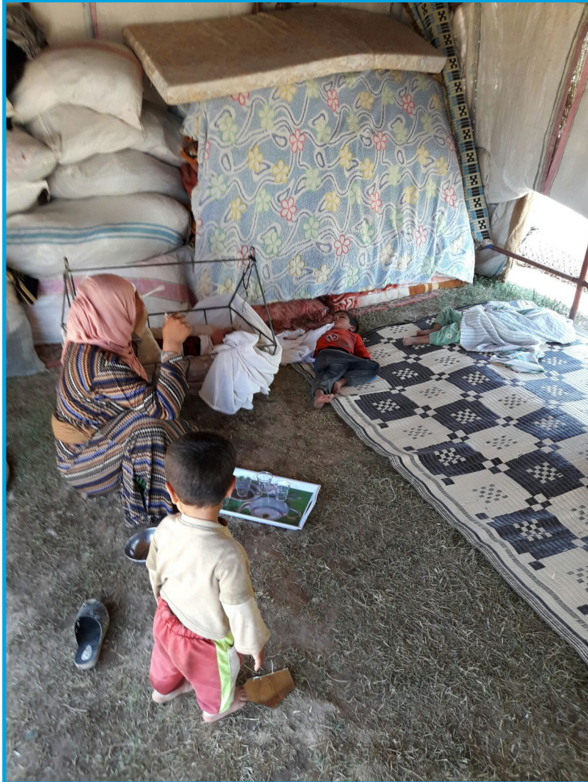
An IDP camp in the vicinity of al Salhabiya al Sharqiya village, west suburbs of Raqqa – June 2017.

SDF have to let the residents go back to their homes immediately, end the suffering of the residents of al Salhabiya al Sharqiya, and secure immediate and speedy food and medical aids.