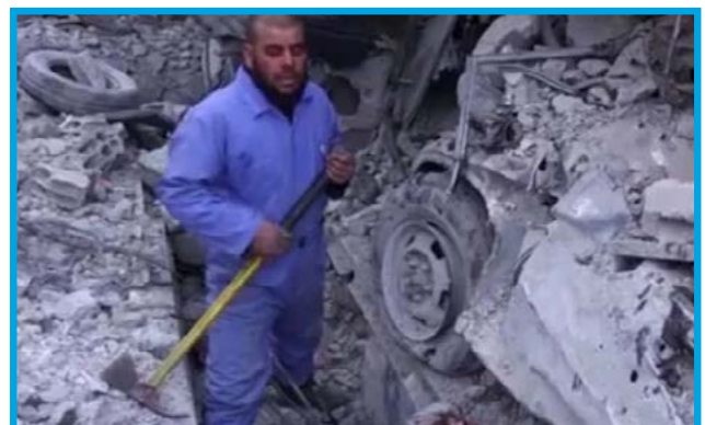
An attempt to pull out a victim who was killed in the massacre perpetrated by international coalition forces warplanes at al Manara carwash in al Tabaqa, al Raqqa, March 21, 2017

Tuesday, March 21, 2017, fixed-wing international coalition forces warplanes fired a number of missiles at al Manara carwash in al Tabaqa city in the western suburbs of al Raqqa governorate , which resulted in the killing of six civilians at once including one child. The city is under the control of ISIS.