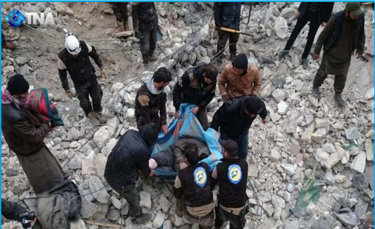
A victim being pulled out after a massacre perpetrated by international coalition forces at Omar ben al Khattab Mosque in al Jina village, Aleppo, March 16, 2017

Thursday evening, March 16, 2017, fixed-wing international coalition forces warplanes fired a number of missiles at Omar ben al Khattab Mosque in al Jina village in the western suburbs of Aleppo governorate , which resulted in the killing of 38 civilians including five children and one woman. The village is under the control of armed opposition factions.