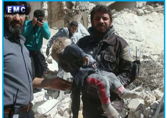
A child's dead body being pulled out in the aftermath of the massacre perpetrated by Syrian regime forces in al Arba'in street in Idlib city, March 19, 2017

Sunday, March 19, 2017, around 10:00, fixed-wing Syrian regime forces warplanes (Su-22) fired two missiles at the residential buildings in al Arba'in street in northwestern Idlib city, which resulted in the killing of three civilians (Three children and three women). Additionally, around seven others were wounded. The city is under the joint control of armed opposition factions and Fateh al Sham Front.