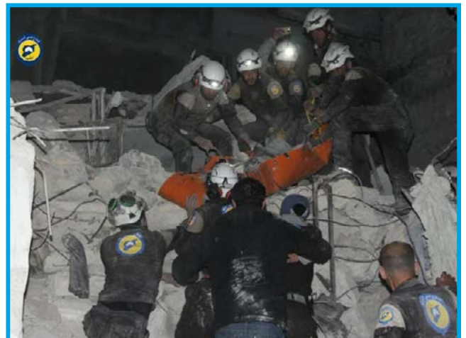
A dead body being pulled out after a massacre perpetrated by Russian forces in Jesr al Shoghour city, Idlib, March 27, 2017

Monday, March 27, 2017, around 23:30, fixed-wing warplanes we believe were Russian fired a missile at a residential building in northwestern Jesr al Shoghour city in the western suburbs of Idlib governorate, which resulted in the killing of five civilians, who were from the same family, including three children. Additionally, about seven others were wounded. The city is under the joint control of armed opposition factions and Fateh al Sham Front.