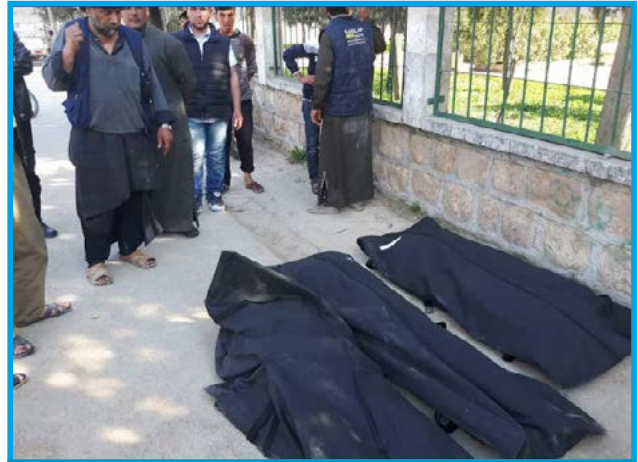
Dead bodies of victims killed in the massacre perpetrated by Russian forces in al Der al Sharqi village, Idlib using cluster submunitions, March 29, 2017

Wednesday, March 29, 2017, fixed-wing warplanes we believe were Russian fired three missiles carrying cluster submunitions at Omar ben Abdul Aziz Mosque and the surrounding area in the middle of al Der al Sharqi village in the eastern suburbs of Idlib governorate, as a gathering of civilians were queuing to buy bread, which resulted in the killing of nine civilians including five children and one woman. Additionally, about 20 others were wounded. The village is under the joint control of armed opposition factions and Fateh al Sham Front.