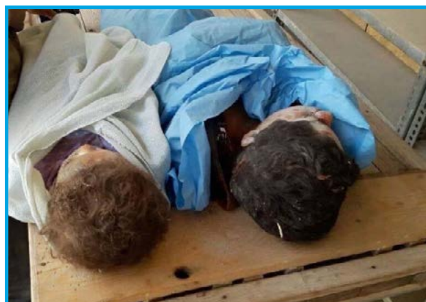
Two children who were killed in the massacre perpetrated by Syrian regime forces in “Al Arba’in Mosque” area in Kafr Nobbol city, Idlib, March 9, 2017

Thursday, March 9, 2017, around 08:00, fixed-wing Syrian regime forces warplanes (Su-24) fired a missile at the residential houses in “ Al Arba’in Mosque ” area in the middle of Kafr Nobbol city in the southern suburbs of Idlib governorate, which resulted in the killing of five civilians at once including three children and one woman. Additionally, around 15 others were wounded. The city is under the joint control of armed opposition factions and Fateh al Sham Front.