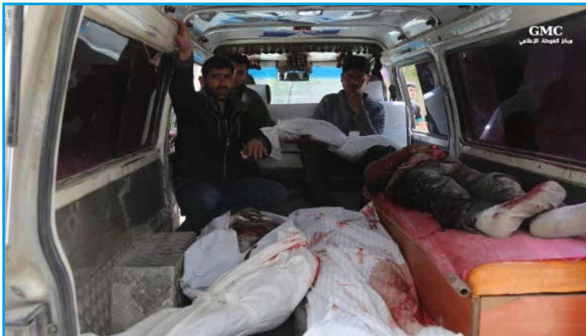
Dead bodies of victims killed in the massacre perpetrated by Syrian regime forces in Hamouriya town, Damascus suburbs governorate, March 25, 2017

“The two targeted areas are civilian areas, where no fighting military factions can be found.”