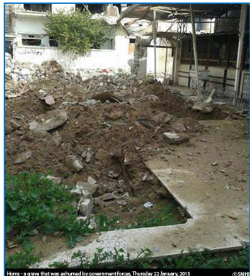
Homs - a grave that was exhumed by government forces, Thursday 22 January, 2015

"On the next day, I tried to get near the place and from Ash-Shaikh Kamel mosque garden, which also was exhumed, and i found out that they exhumed and took the corpses. Also, I saw some of the graves exhumed but the corpses weren't taken where government forces covered it with some bushes and trash."