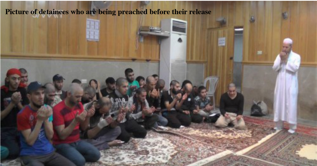
Picture of detainees who are being preached before their release

Before releasing prisoners, The Sharia Committee gathers the prisoners who are to be released and preaches them.