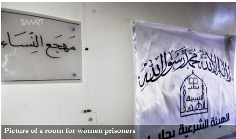
Picture of a room for women prisoners