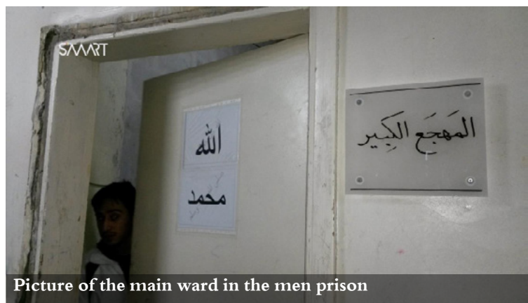
Picture of the main ward in the men prison