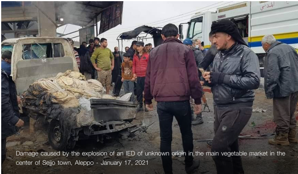
Damage caused by the explosion of an IED of unknown origin in the main vegetable market in the center of Sejjo town, Aleppo - January 17, 2021

On Sunday, January 17, 2021, an IED of unknown origin exploded in the main vegetable market in the center of Sejjo town in the northern suburbs of Aleppo governorate, resulting in casualties, in addition to causing moderate material damage to a number of shops in the market . SNHR is still trying to contact witnesses to obtain more details of the incident. The town was under the control of the Syrian National Army at the time of the incident.